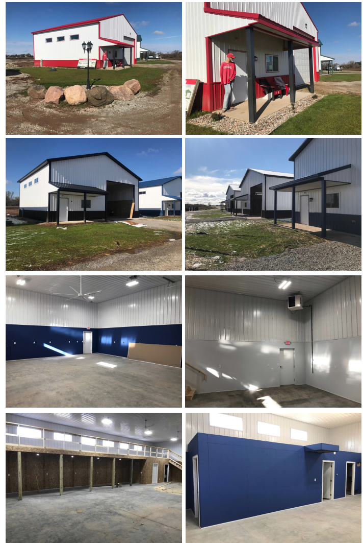
Photos are of our first Neenah location. Design may vary.