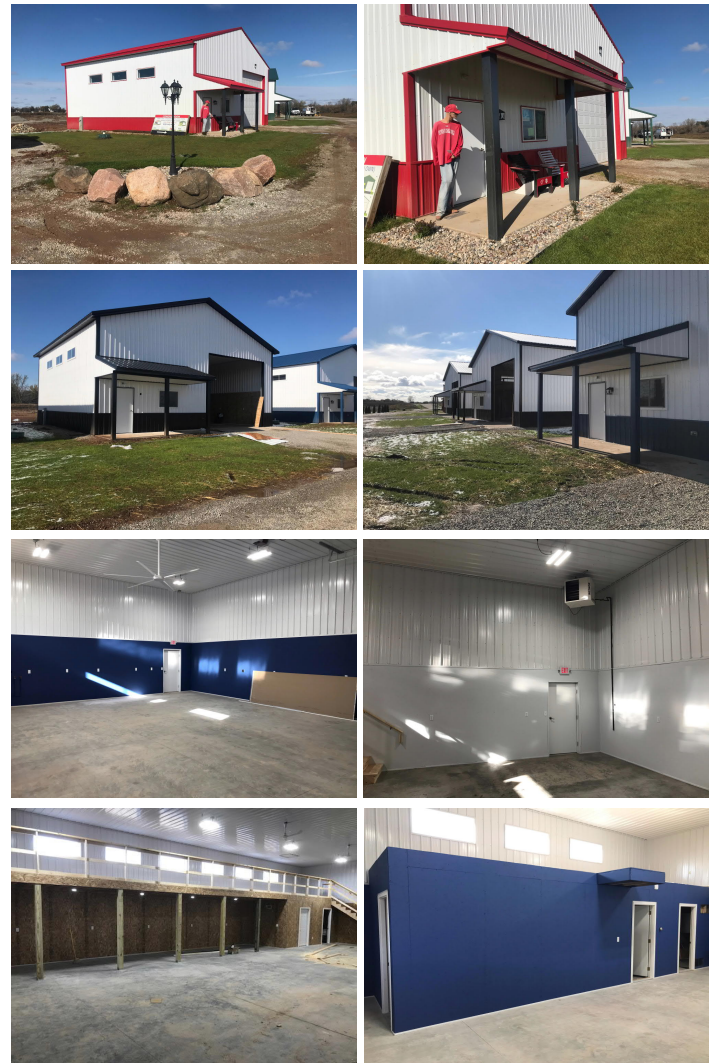
Photos are of our first Neenah location. Design may vary.